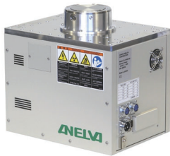
Standard Holder Type