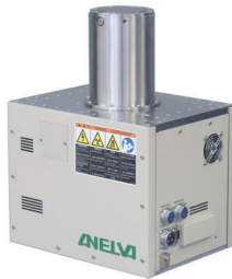
Long Holder Type

✓High Speed Photography with High Resolution